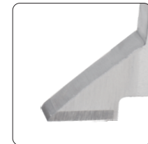
Carbide tipped jaws