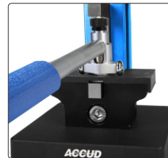
Gauge block set for 256-160-11