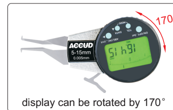
display can be rotated by 170°