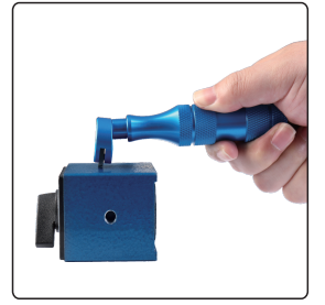
step 1: make grid cutting on surface