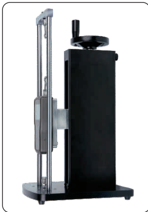
Stand(Code: FS1000 , Optional )