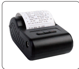
PR100 printer ( Optional )