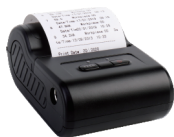
PR100 printer (Optional)