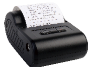
PR100 printer (Optional)