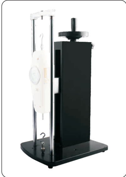
Stand (Code: FS1000 , Optional )